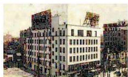
明治製菓ビルヂング 1933年竣工 Meiji Seika Bidg, Completed in 1933