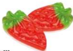
No: 039 Big Strawberry Min: 5,5g - Max: 8g