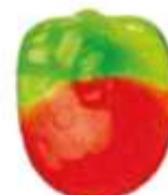
No: 116 Strawberry Min: 3g - Max: 4g