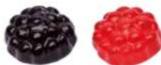
No: 072 Big Blackberry Min: 3g - Max: 5g