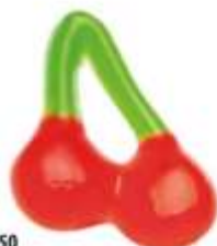
No: 150 Big Cherry Min: 9g - Max: 10g