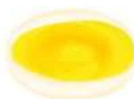
No: 123 Small Egg Min: 2,2g - Max: 2,5g