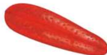
No: 201 Tongue Min: 15g