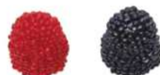
No: 029 Bead Blackberry Min: 2g - Max: 2,2g