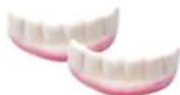
No: 012 Mini Teeth Min: 2g - Max: 2,1g