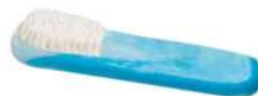
No: 104 Toothbrush Min: 5g - Max: 6g