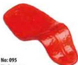
No: 095 Big Tongue Min: 18g - Max: 22g