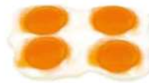
No: 162 Omelet Min: 8g - Max: 10g