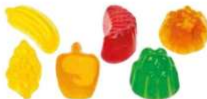
No: 090 Fruit Garden Min: 2g - Max: 2,2g