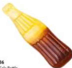
No: 136 Huge Cola Bottle Max: 20g