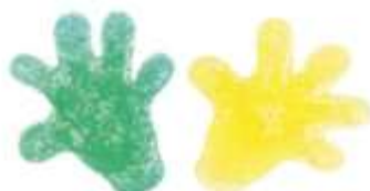
No: 179 Hand Min: 4,5g - Max: 5g