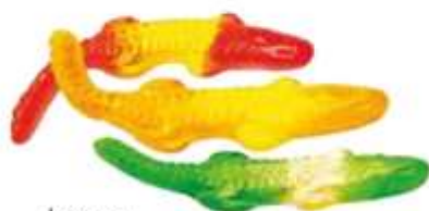
No: 100 Big Crocodile Min: 12g - Max: 14g