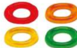
No: 167 New Small Ring Min: 2g - Max: 2,5g