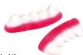
No: 042 Dracula Teeth Min: 3g - Max: 4g