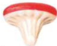
No: 060 Mushroom Min: 2g - Max: 2,1g