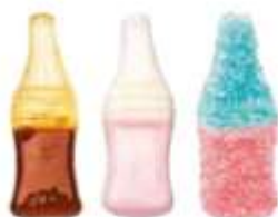
No: 147 Small Cola Bottle Min: 2g - Max: 2,1g