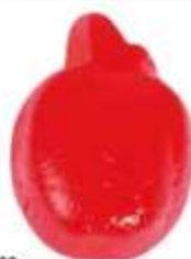
No: 182 Big Apple Max: 6g