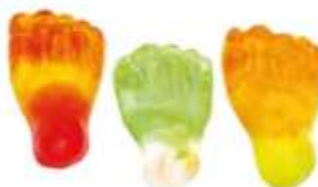
No: 005 Big Foot Min: 5g - Max: 6g