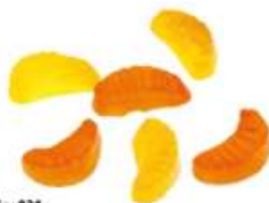
No: 021 Tangerine Slice Min: 1,7g - Max: 2,2g