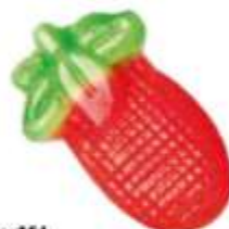
No: 154 Strawberry with Leaf Min: 6g - Max: 8g