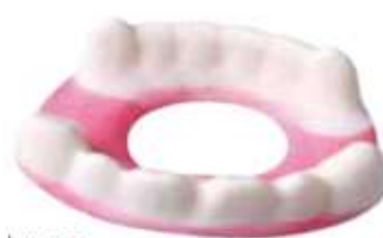
No: 142 Vampire Teeth Min: 6g - Max: 7g