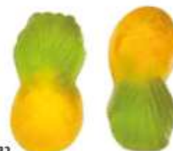
No: 032 Big Pineapple Min: 5g - Max: 7g