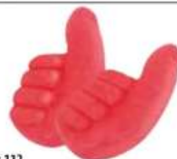
No: 112 Thumbs Up Min: 5g - Max: 6g