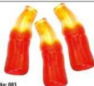
No: 083 Medium Cola Bottle Min: 5,5g - Max: 6g