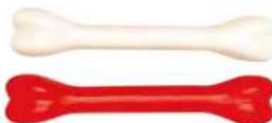
No: 137 Huge Bone Max: 20g