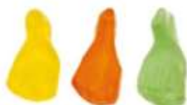
No: 081 Small Foot Min: 3,5g - Max: 4g