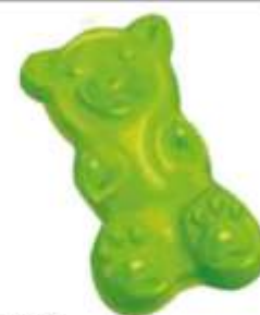
No: 155 Huge Bear Min: 25g - Max: 30g