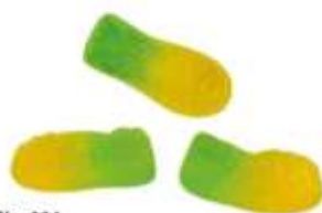
No: 114 Small Pineapple Min: 1,7g - Max: 2g