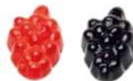
No: 023 Grape Min: 2g - Max: 2,1g