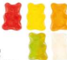
No: 051 Big Bear Min: 5g - Max: 8g