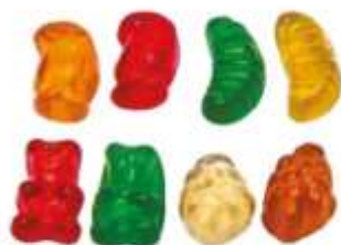
No: 106 Assorted Min: 1,35g - Max: 1,4g