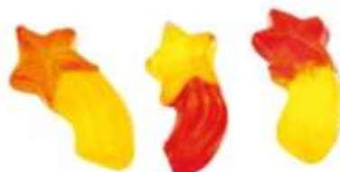
No: 046 Cornet Min: 5g - Max: 6g