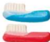
No: 014 Small Brush Min: 1,7g - Max: 2g