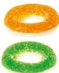
No: 031 Ring Min: 6g - Max: 8g