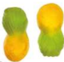
No: 074 Medium Pineapple Min: 3g - Max: 4g