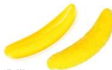
No: 105 Banana Min: 4,5g - Max: 5g