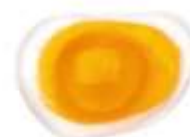
No: 075 Egg Min: 2,8g - Max: 3g