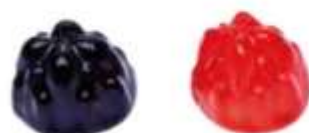
No: 022 Small Blackberry Min: 2g - Max: 2,1g