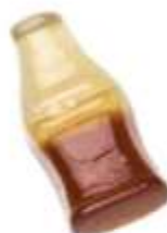
No: 061 Medium Cola Bottle Min: 3,5g - Max: 4g