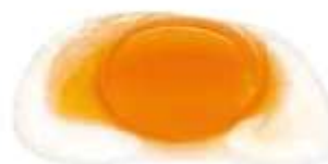
No: 128 Big Egg Min: 6g - Max: 7g