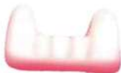
No: 013 Vampire Teeth Min: 6g - Max: 7g