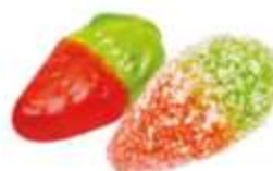
No: 152 Small Strawberry Min: 1,6g - Max: 2,08g