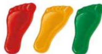
No: 202 Foot Min: 15g