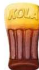
No: 172 Cola Glass Min: 8,2g - Max: 10g