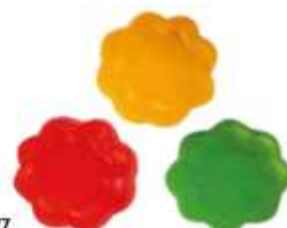
No: 077 Daisy Min: 3,5g - Max: 4g