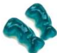
No: 008 Dolphin Min: 2g - Max: 2,1g