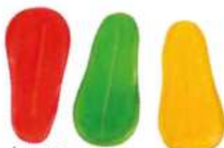
No: 071 Chombo Tongue Min: 18g - Max: 22g