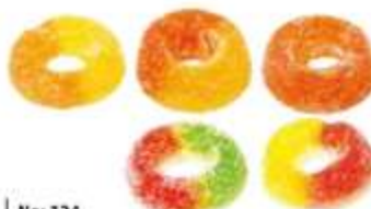
No: 124 Small Ring Min: 2,25g - Max: 2,8g