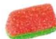
No: 126 Watermelon Min: 3g - Max: 3,5g