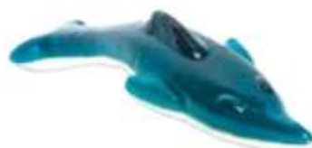
No: 138 Big Dolphin Max: 20g