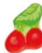
No: 098 Small Cherry Min: 3g - Max: 4g