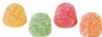
No: 029 Dot Min: 1,6g - Max: 1,7g