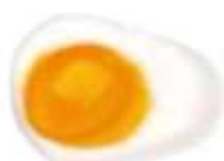
No: 026 Medium Egg Min: 2,5g - Max: 3g