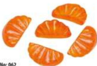
No: 062 Orange Slice Min: 3,5g - Max: 4g