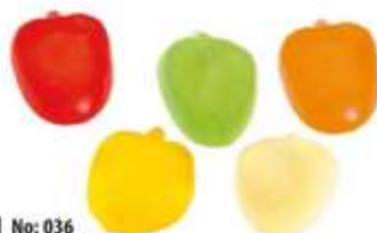
No: 036 Small Apple Min: 2g - Max: 2,1g