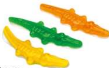
No: 003 Crocodile Min: 10g - Max: 15g